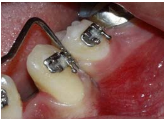
Fig. 3: Probing of the gingival invagination