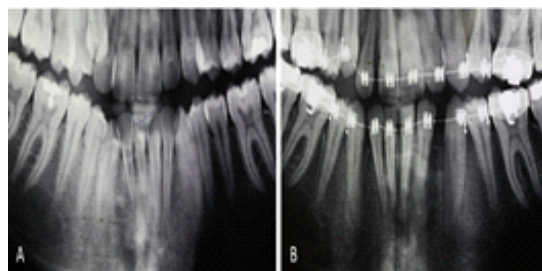
Fig. 4: Digital panoramic radiographs before (A) and after (B) space closure. Root resorption after space closure was not detectable