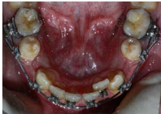
Fig. 2: Ni-Ti closed coil spring placed between the canine and first molar